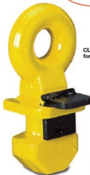
CLT for top lifting