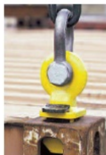
Container lifting lug CLT