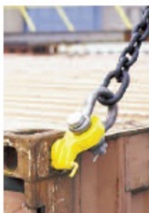
Container lifting lug CLB