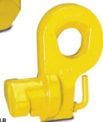
CLB for side lifting